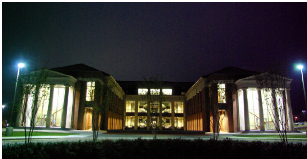
The University of Mississippi School of Law