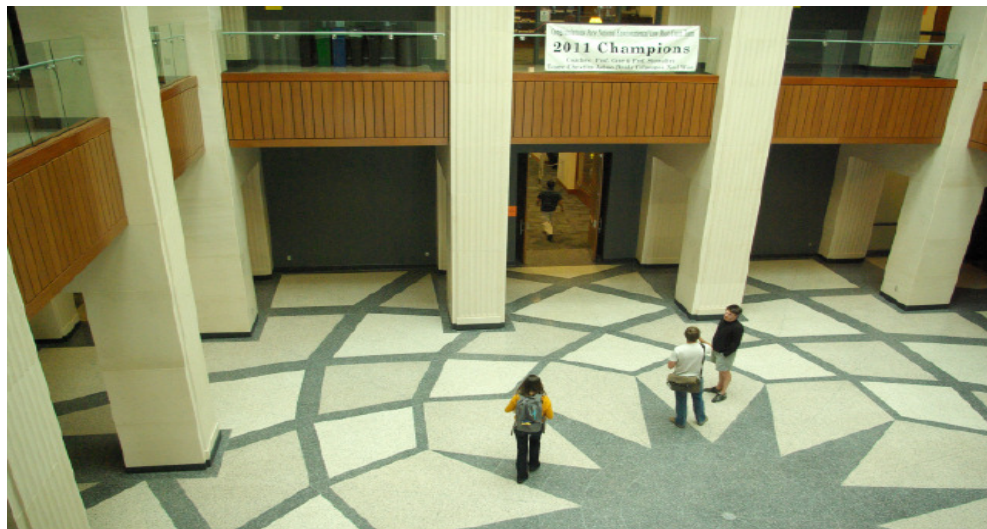
The University of Mississippi School of Law